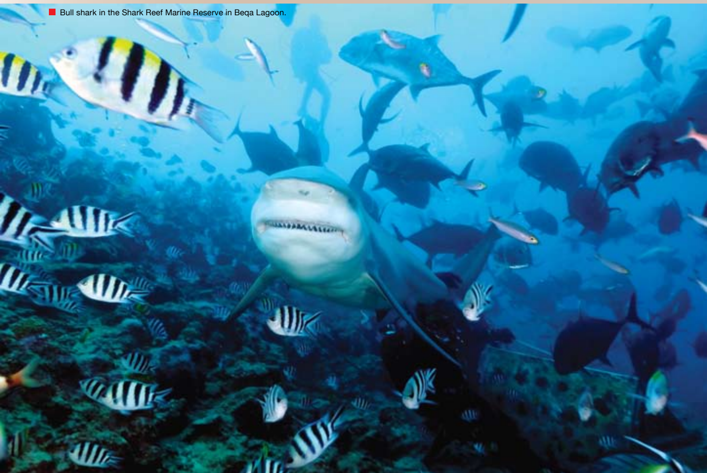
■ Bull shark in the Shark Reef Marine Reserve in Beqa Lagoon.