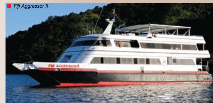
■ Fiji Aggressor II