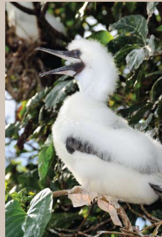
■ A Red-Footed booby chick screams for attention at Mubualau.