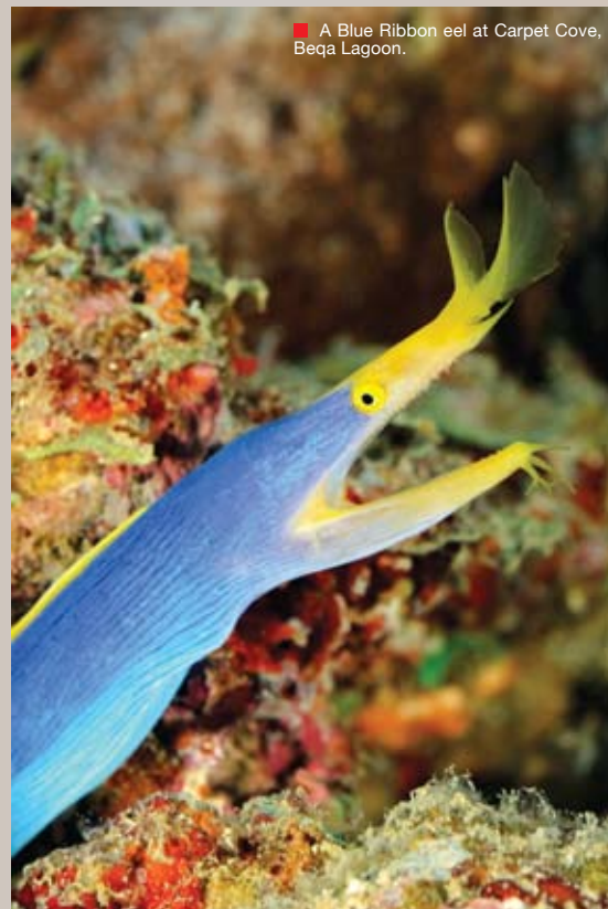
■ A Blue Ribbon eel at Carpet Cove, Beqa Lagoon.