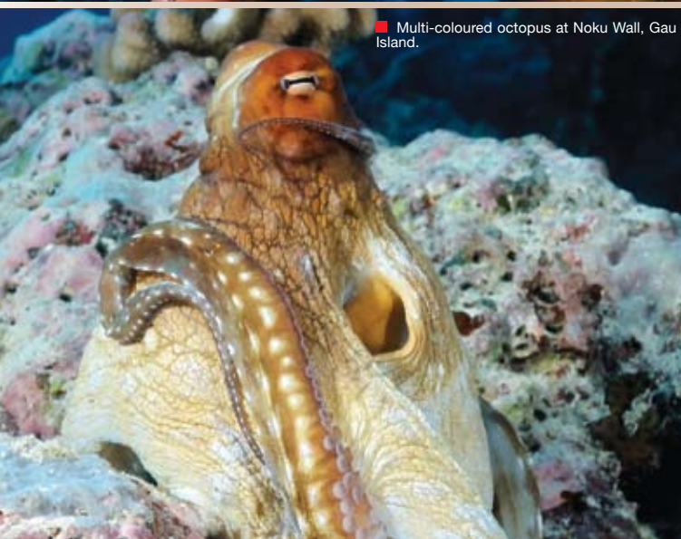
■ Multi-coloured octopus at Noku Wall, Gau Island.