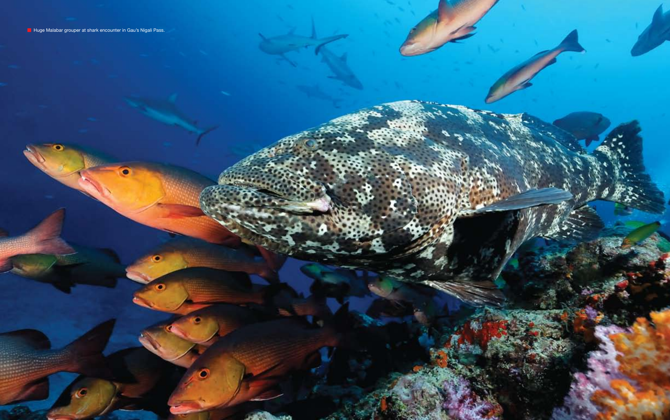
■ Huge Malabar grouper at shark encounter in Gau's Nigali Pass.