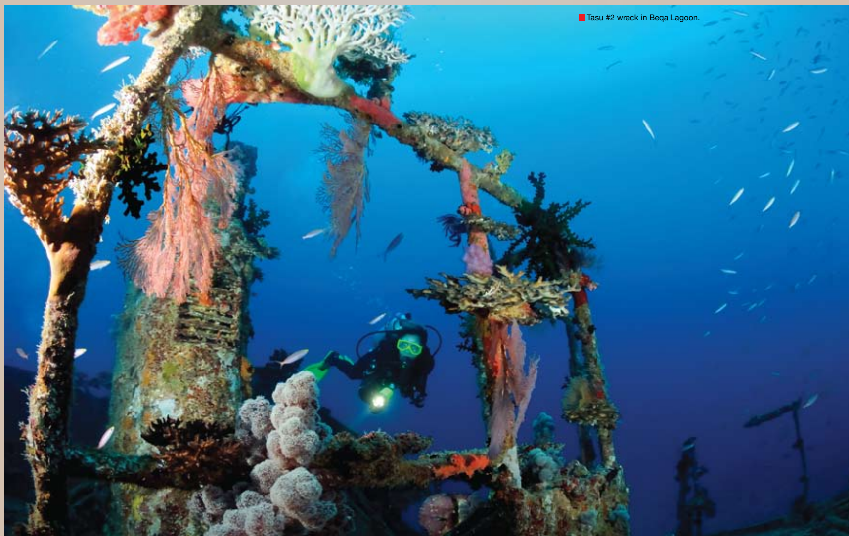
■ Tasu #2 wreck in Beqa Lagoon.